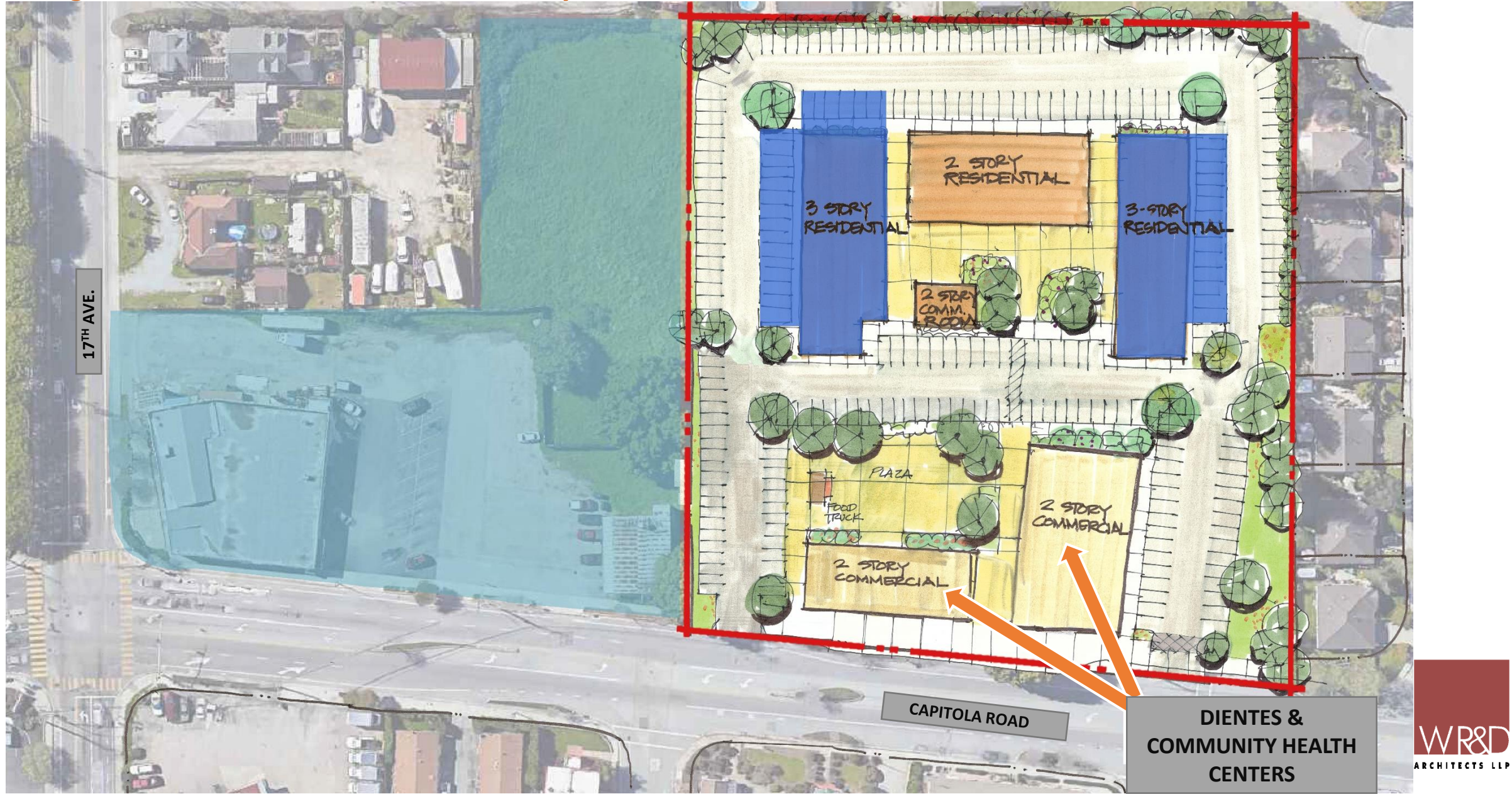
Using current land available from County